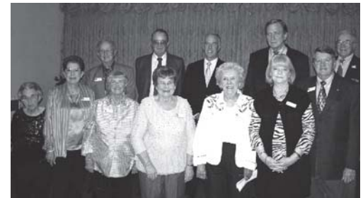
Pictured above is the current MOAA Board. (Find listing of names on page 2)

February will be our salute to the MOAA Auxiliary month. Be sure to save the date February 19th for our special dinner program. Also, we now have the tickets for our March 18th play, "The Mousetrap." See any board member for tickets. Please continue to get your lunch and dinner reservations in before the deadline. Both the Hap Arnold Club and AFWW have given us firm dates to call in our meal requirements and will not accept any changes after those dates.