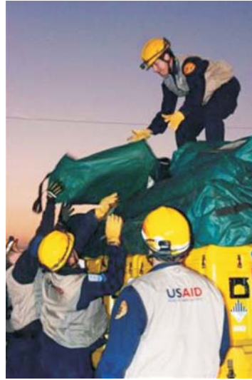
Members of a U.S. Agency for International Development search and rescue team build a pallet for transport on a C-17 Globemaster III Jan. 13, 2010, at March Air Reserve Base, Calif. The USAID personnel are members of the Los Angeles County Fire Department. The C-17 Globemaster III that transported the 72-person team and rescue equipment was from Travis Air Force Base, Calif.