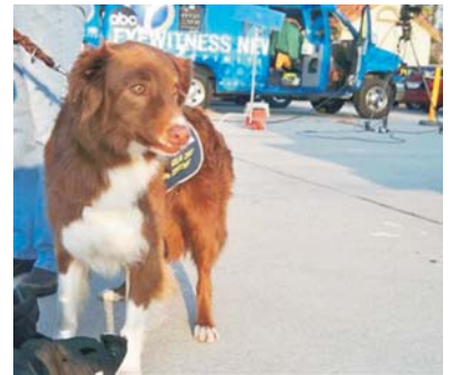
A dog waits patiently while her handler responds to questions from a reporter Jan. 13, 2010, at March Air Reserve Base, Calif. The dog is from a Los Angeles County Fire Department K-9 unit that deployed to Haiti from March ARB.